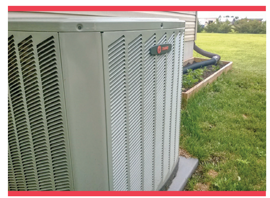
Heat pump systems located outside a home should be cleaned twice a year – in the spring and fall. In addition, be certain to check electrical connections annually and replace or righted as needed.