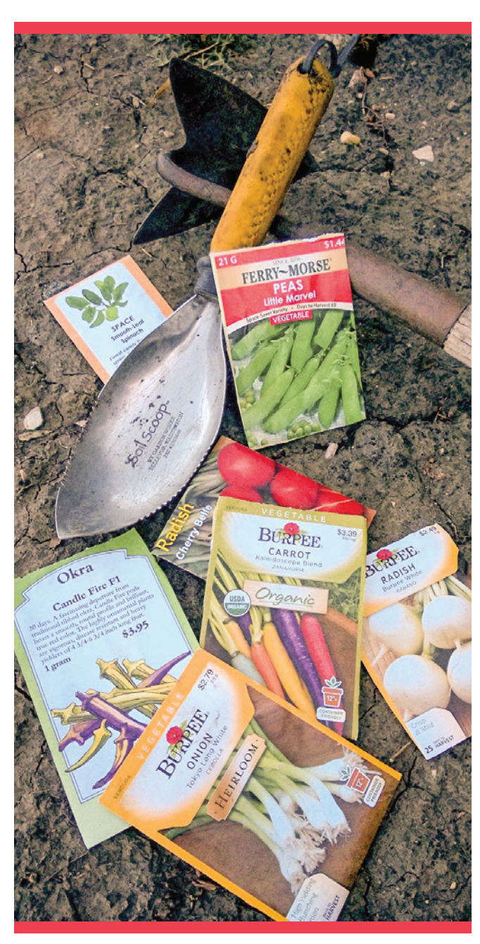
The "grow local, buy local" concept in fruits, vegetables and even meats is a nationwide movement geared toward healthier eating. At the same time, it helps grow local economies, even in McLean County, by supporting local gardeners and farmers markets. The communities of Garrison, Washburn and Parshall have farmers markets each summer. "Grow local, buy local" could even extend to a year-around greenhouse if a potential commercial greenhouse under consideration at Coal Creek Station near Underwood comes to fruition.

"Buy local, grow local" takes on an array of meanings, just as the N.D. Department of Agriculture defines local foods. It can be purchasing seasonal fruits and vegetables