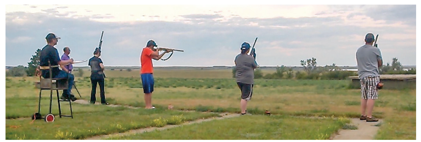
A trapshooter takes aim at a clay target while others await their turn at the Turtle Lake Wildlife Club. League members shoot Wednesday and Sunday evenings during summer months.