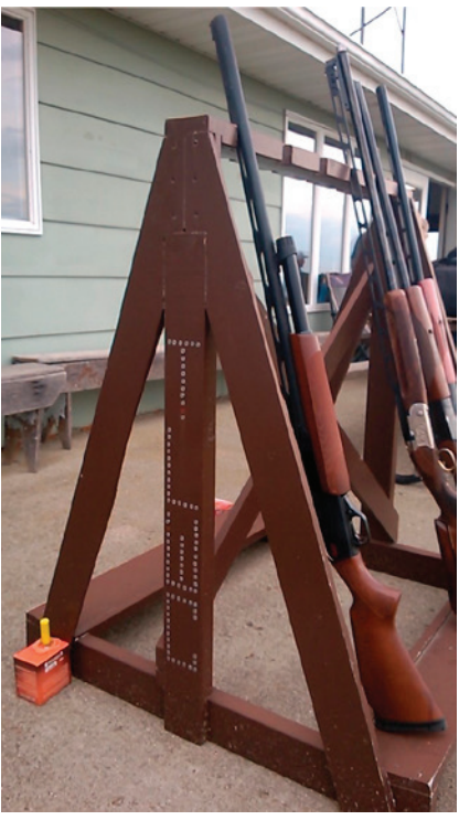
Gun racks embellished with "TLWC" outside of the Turtle Lake Wildlife Club shooting facility are at rest until their owners take to their first stand to shoot. The racks provide a safe place to rest shotguns until it's time for a trapshooter to test his or her skill at another round of trap. The target is a round, flat clay "pigeon." The goal is to shoot 25 for 25.

Equally as important, Seeger hopes hunter education will continue at the clubhouse for years to come, teaching young and old alike about firearms and firearm safety, as well as introducing them to something that has long been part of North Dakota's heritage – hunting.