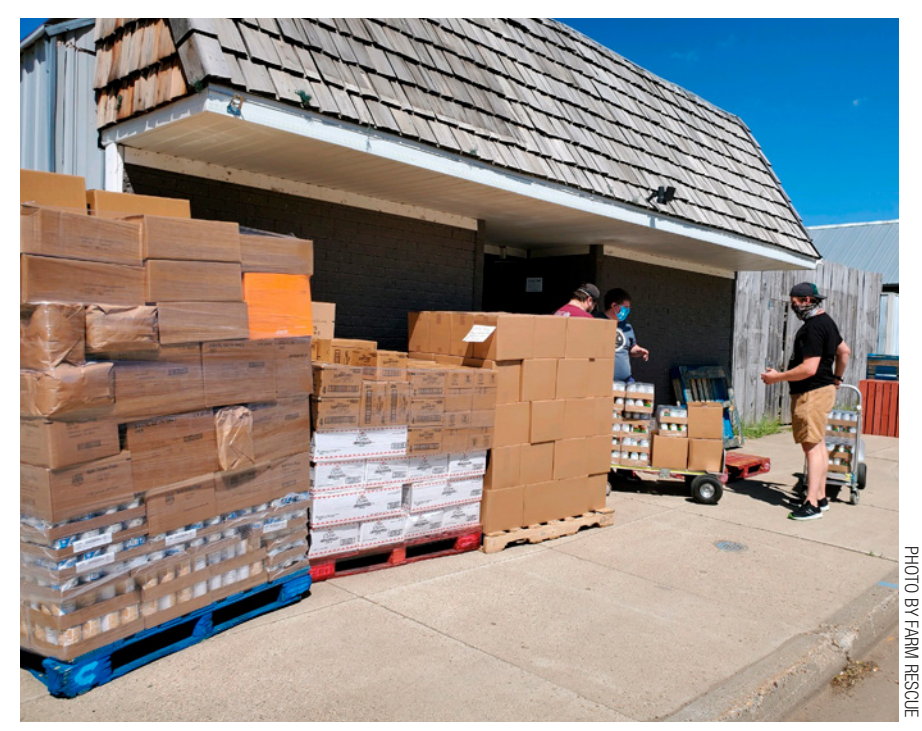
Volunteers help unload the Great Plains Food Bank truck at the Garrison Area Resource Center & Food Pantry. The food pantry was in high demand during COVID-19 and increased their food deliveries to twice a month.