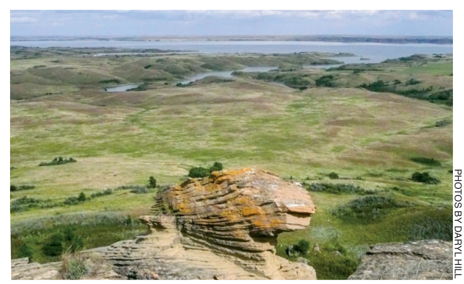
The view of Saddle Butte from Saddle Butte Bay on Lake Sakakawea. Deepwater Bay, where the Hill family cabin is located on Lot No. 1, is several miles north across Lake Sakakawea from there. "It's just one of many cruising destinations enjoyed by the Hill family on Lake Sakakawea," Daryl Hill described.