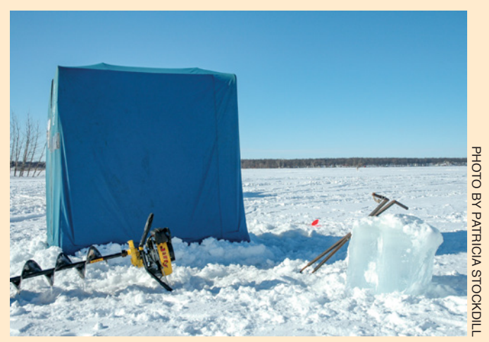
Drilling several holes and pulling the ice chunk out with ice tongs is all part of the darkhouse spearing experience.

However, wind is one of the biggest influencers of water clarity, especially in the fall right before ice-over. Strong winds create wave action, which contributes to suspended materials becoming churned up beneath the surface.