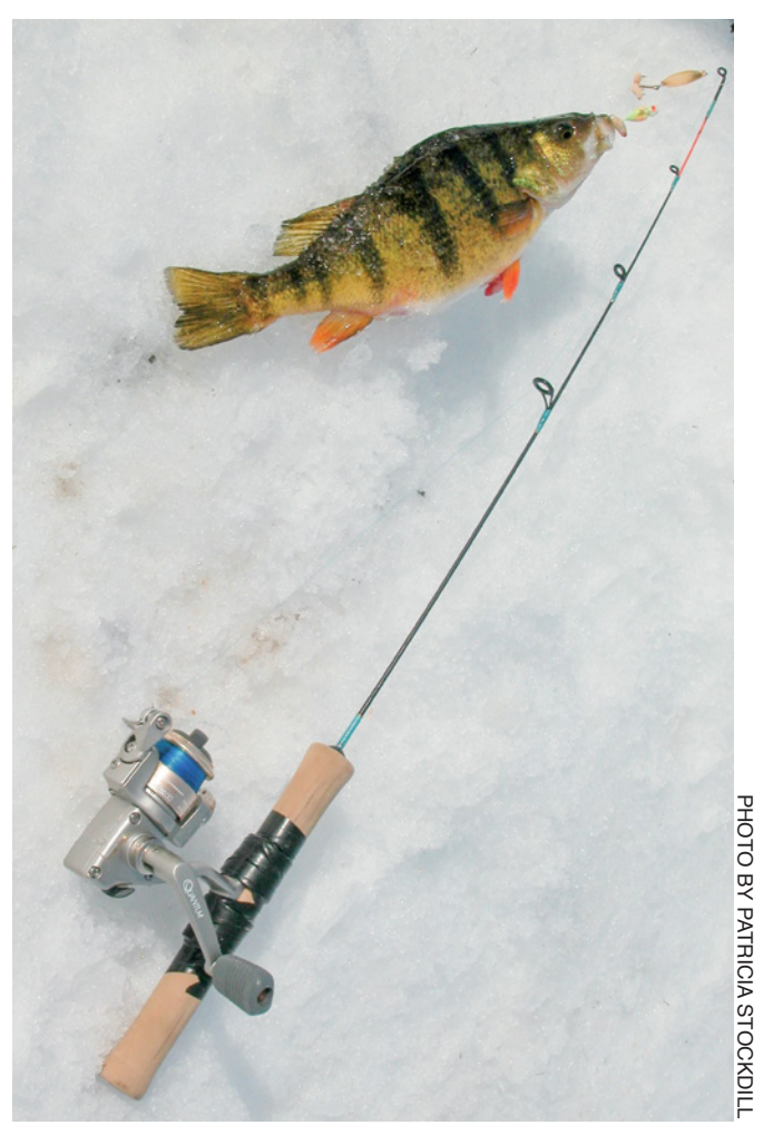
While several McLean County lakes offer winter perch fishing opportunities, it's a treat to catch a nice keeper.

ake Sakakawea may be one of the most popular summer fishing lakes in North Dakota – and the region. But in the winter, its "little sister" lake to the east, Lake Audubon, garners most people's attention.