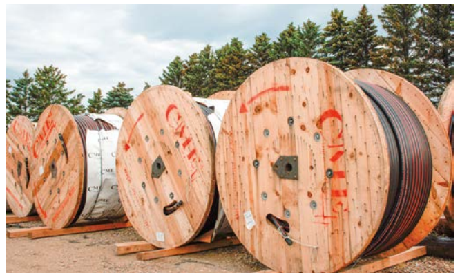
Large reels of underground wire in McLean Electric Cooperative's materials yard.

Because it's a good idea to have a plan, especially one that is flexible and visionary with long-term goals. ■