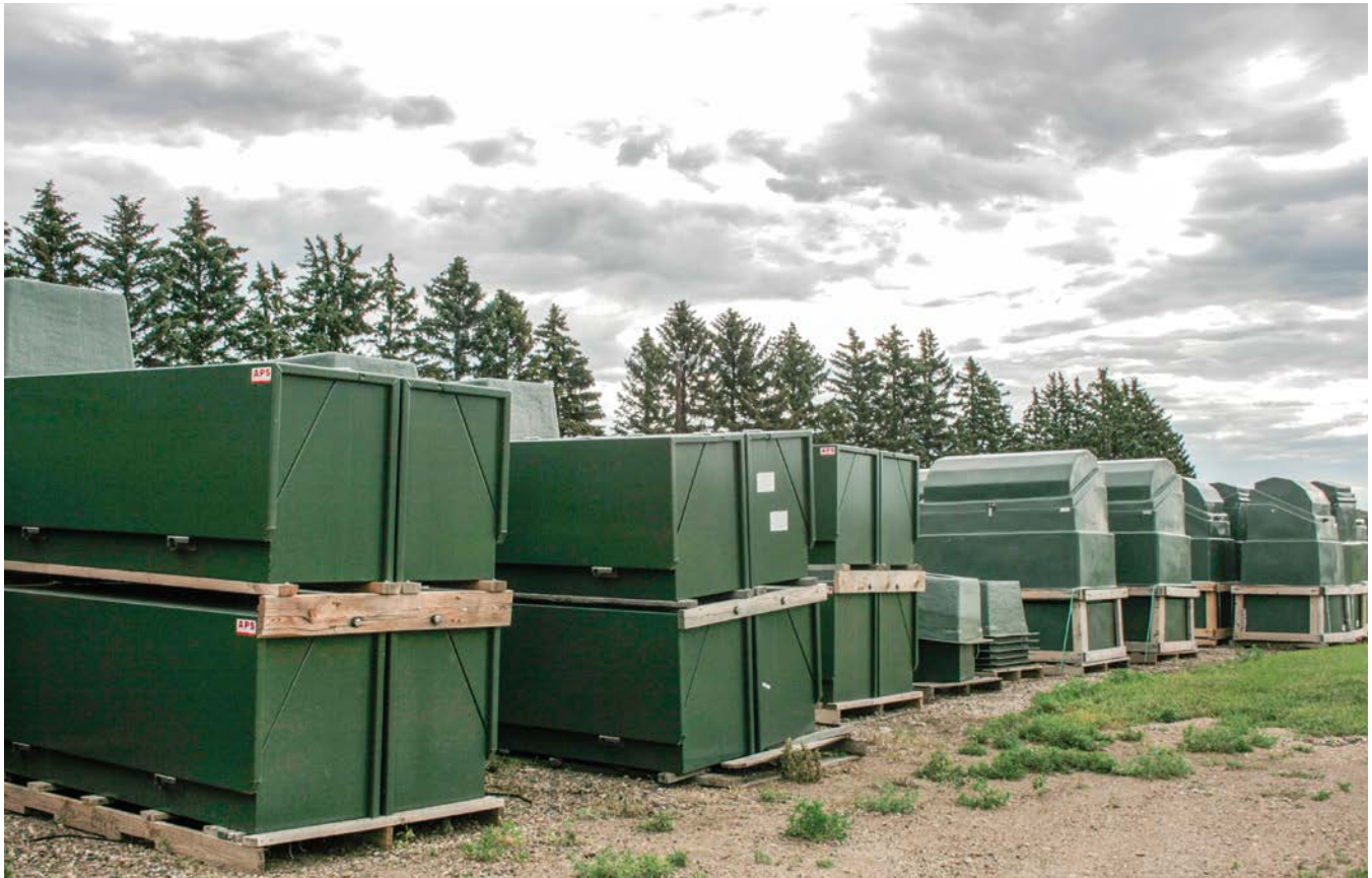
Several underground cabinets and enclosures in McLean Electric Cooperative's materials yard in preparation for 2022 construction.