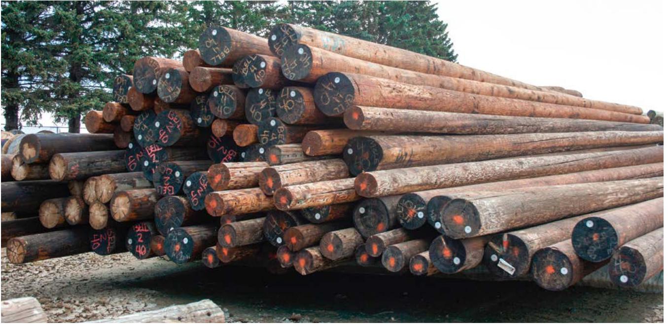
McLean Electric Cooperative has a full stack of 40-foot poles in 2022 in preparation for a busy construction season.