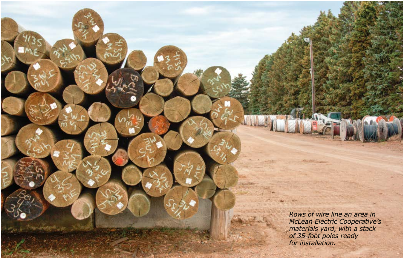
Rows of wire line an area in McLean Electric Cooperative's materials yard, with a stack of 35-foot poles ready for installation.